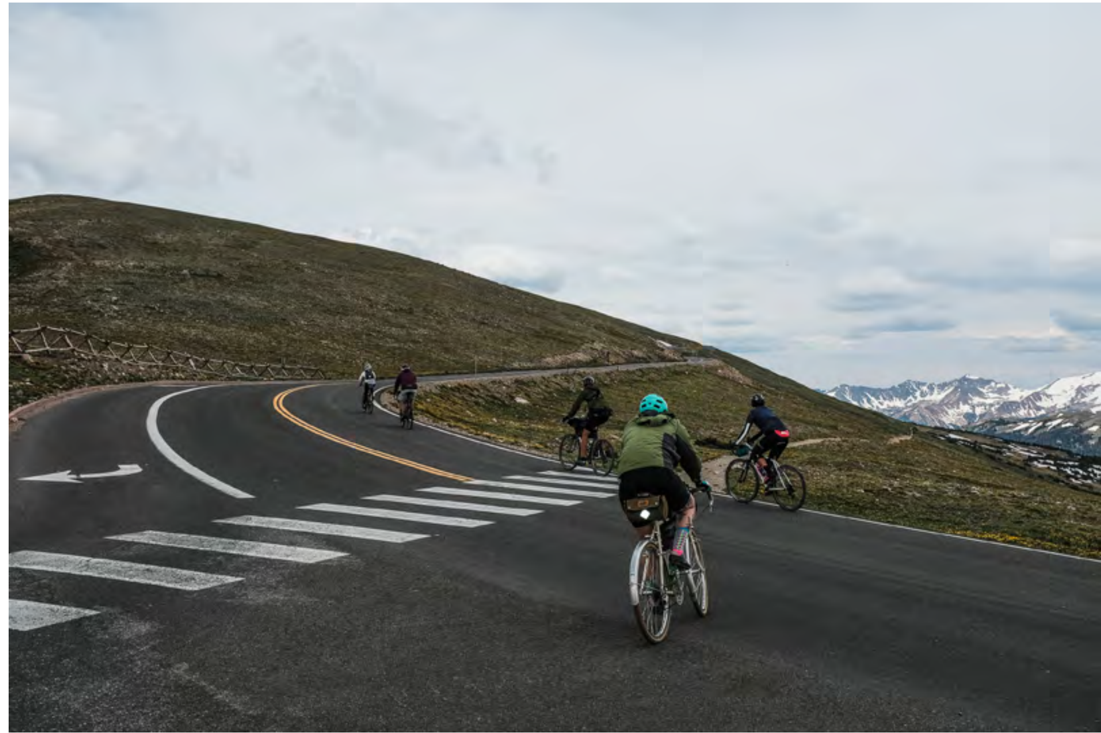
trail ridge road