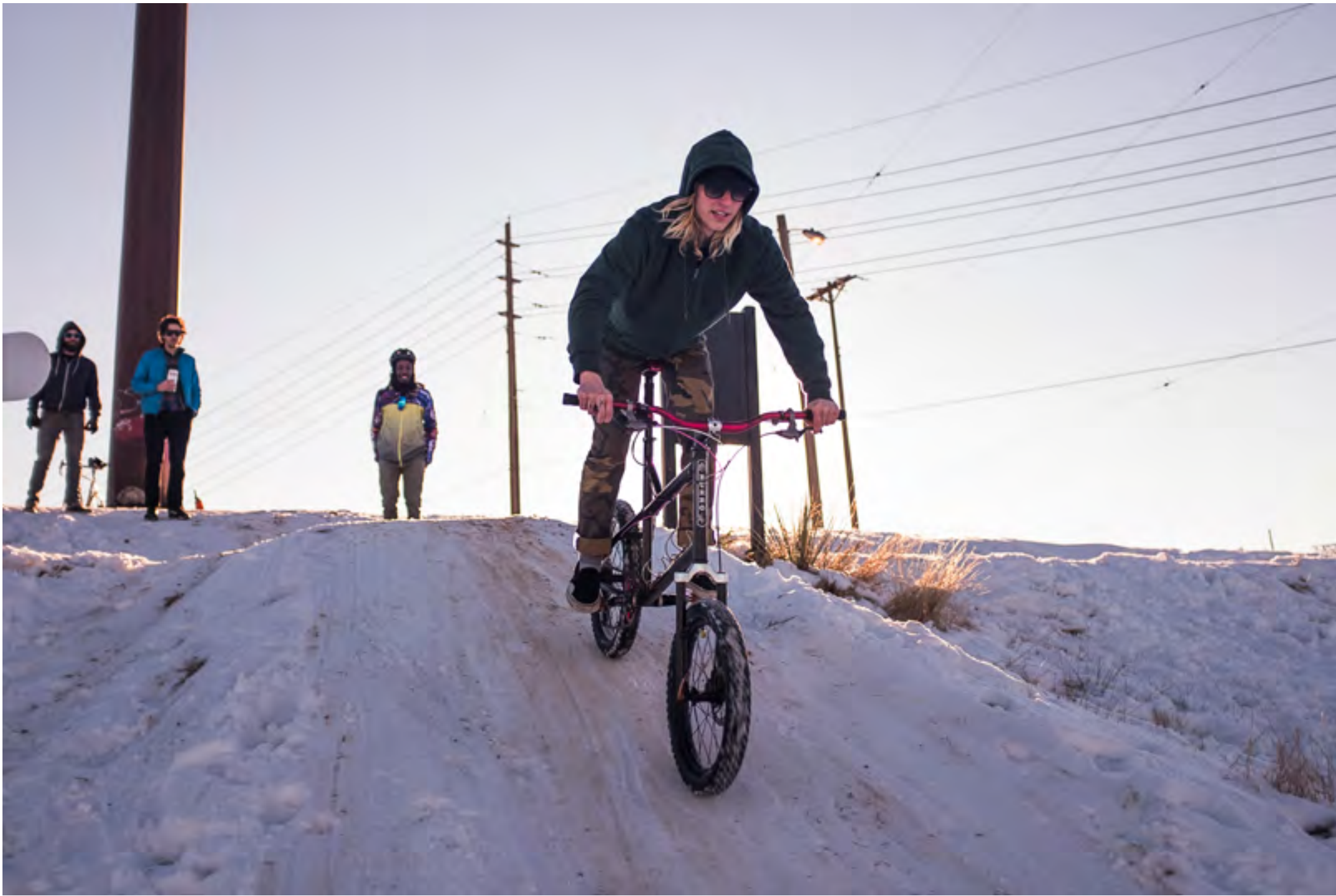
ruby hill bike park; mason