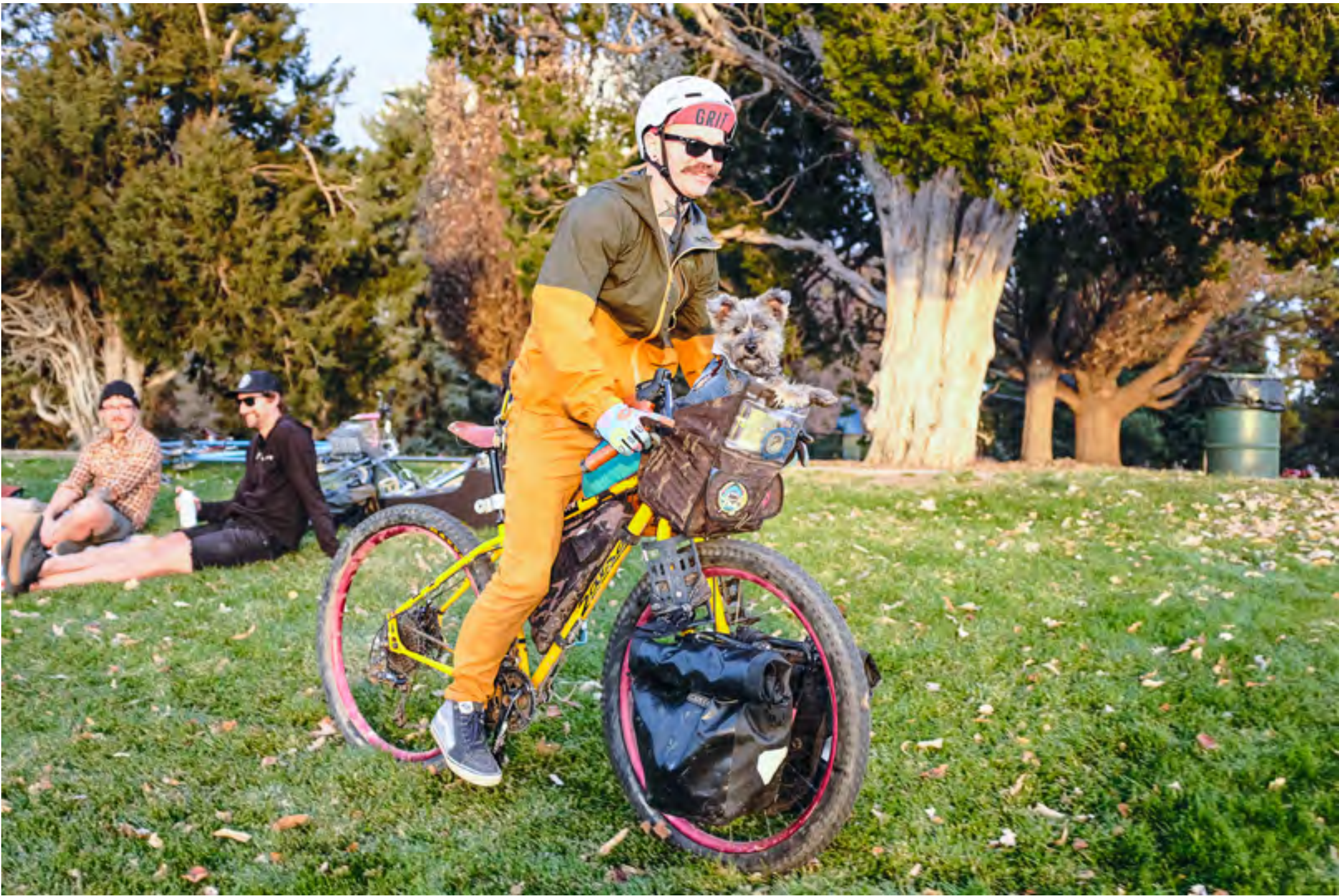
cheesman park; john wayne, dog