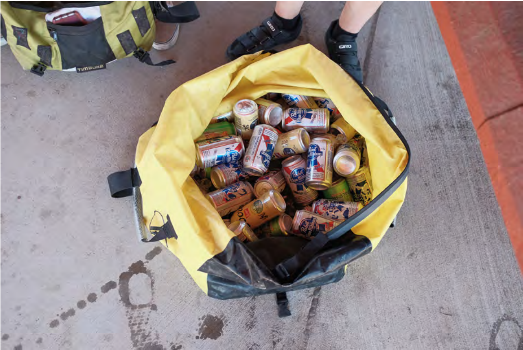
beer delivery for team meow; pbr