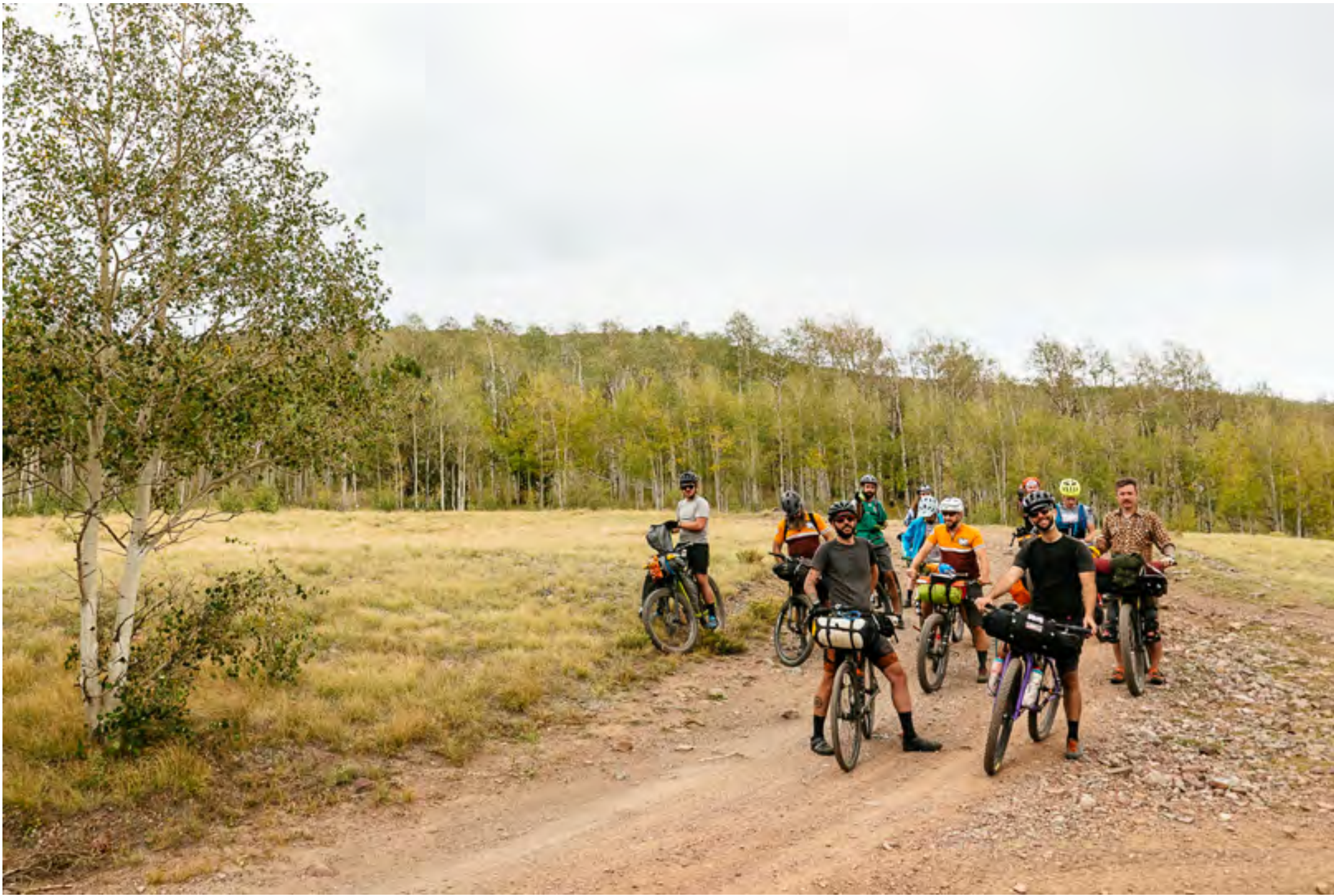
bikepacking against the machine