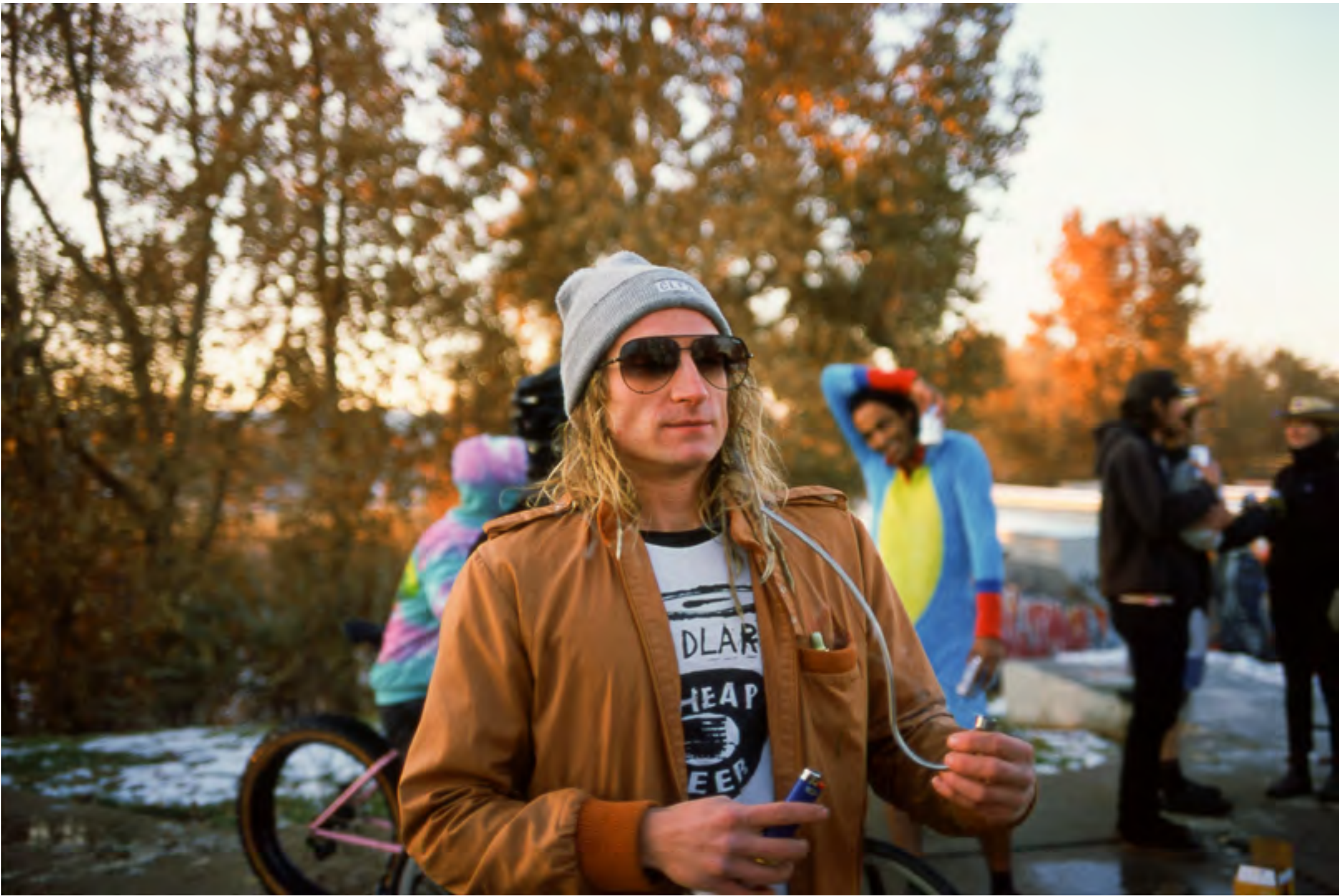
carpio sanguinette park; reeves