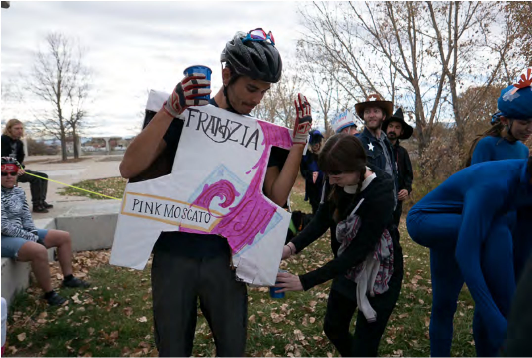
team meow; franzia boxed wine