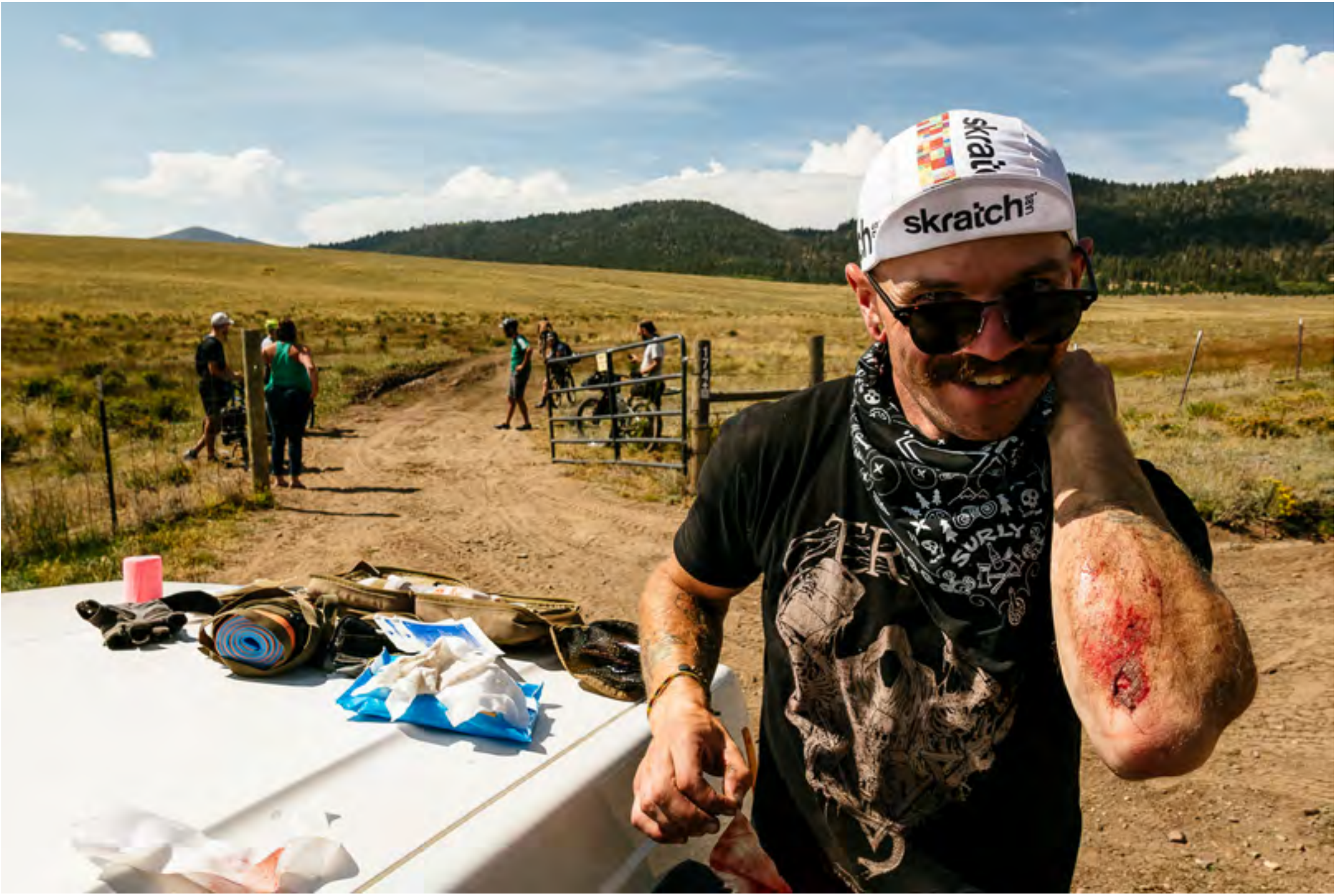
bikepacking against the machine; john wayne