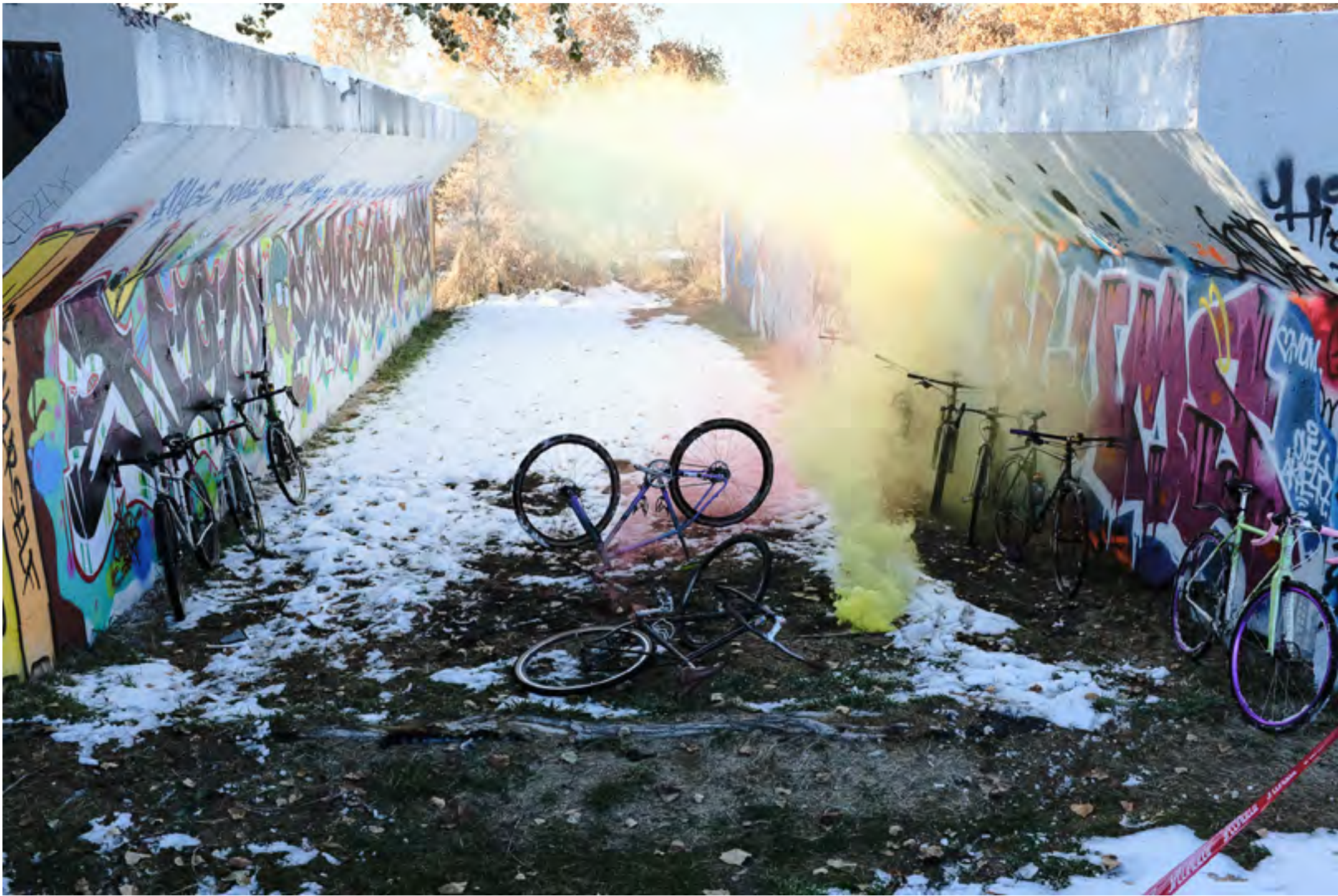
alternative milk cycling