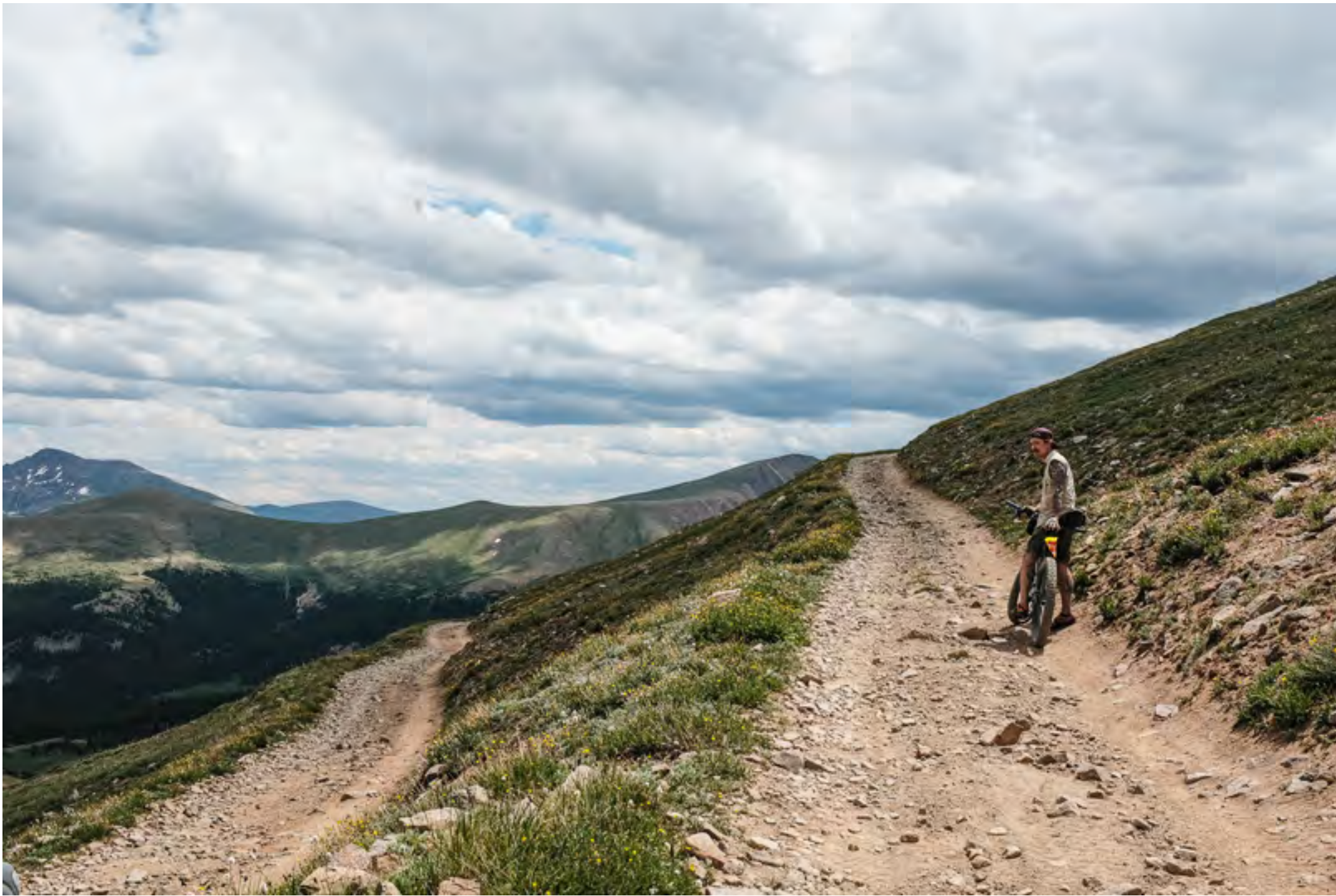
mcclellan mountain; brian