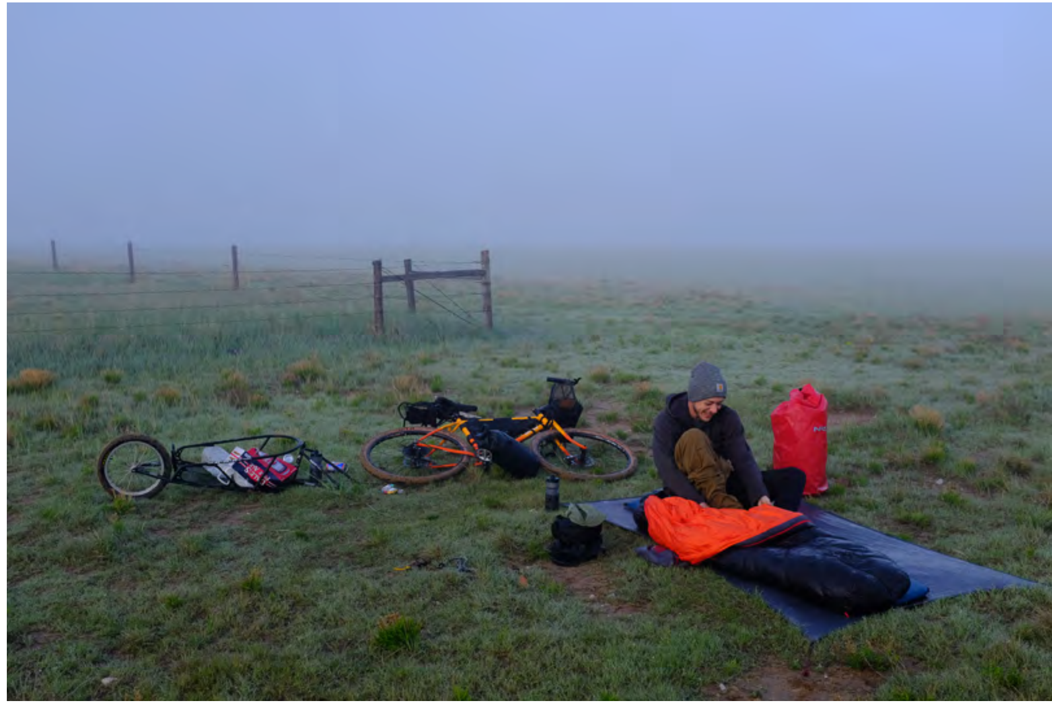
pawnee grasslands; sam