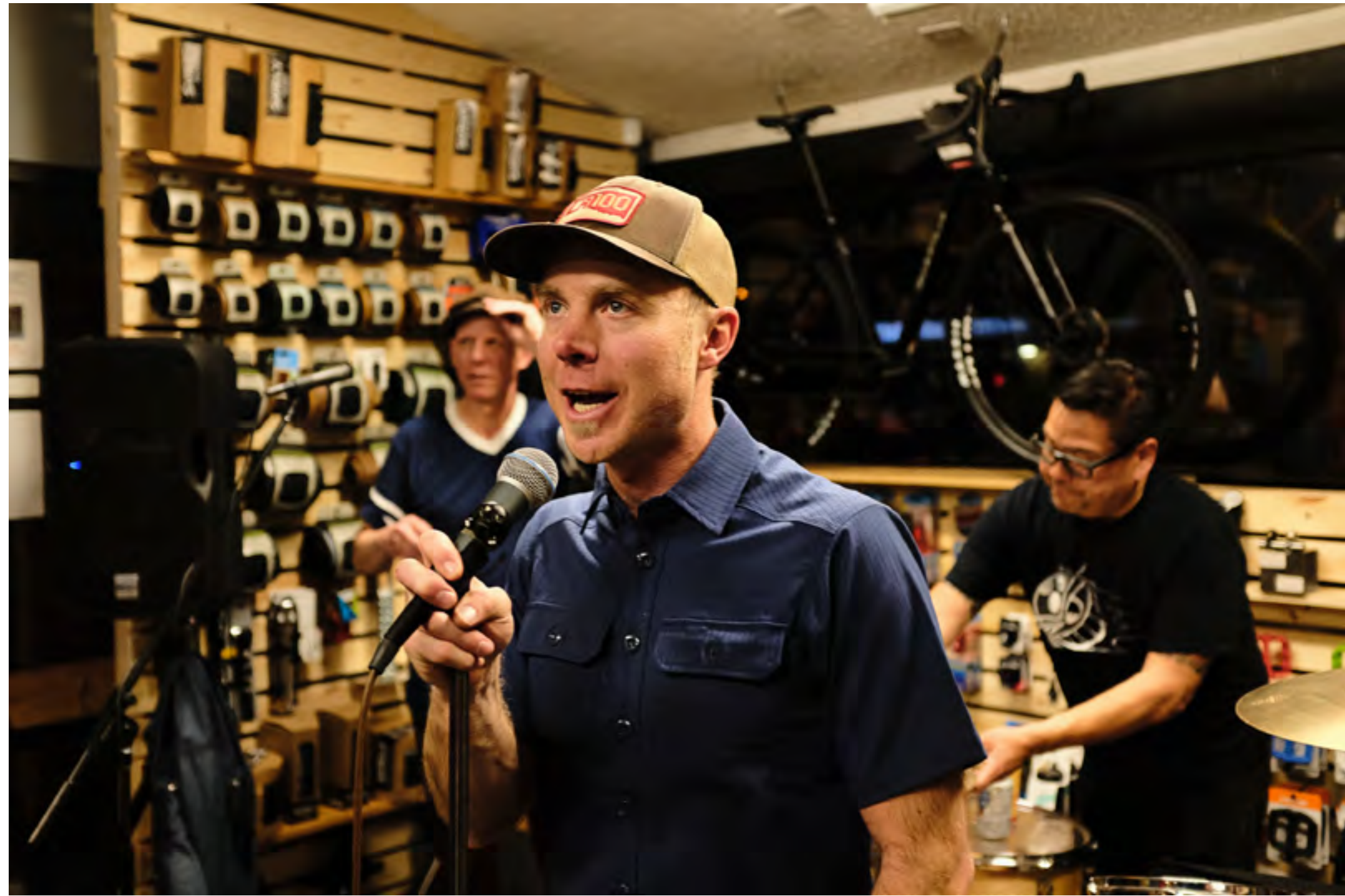
yawp! cyclery; levi