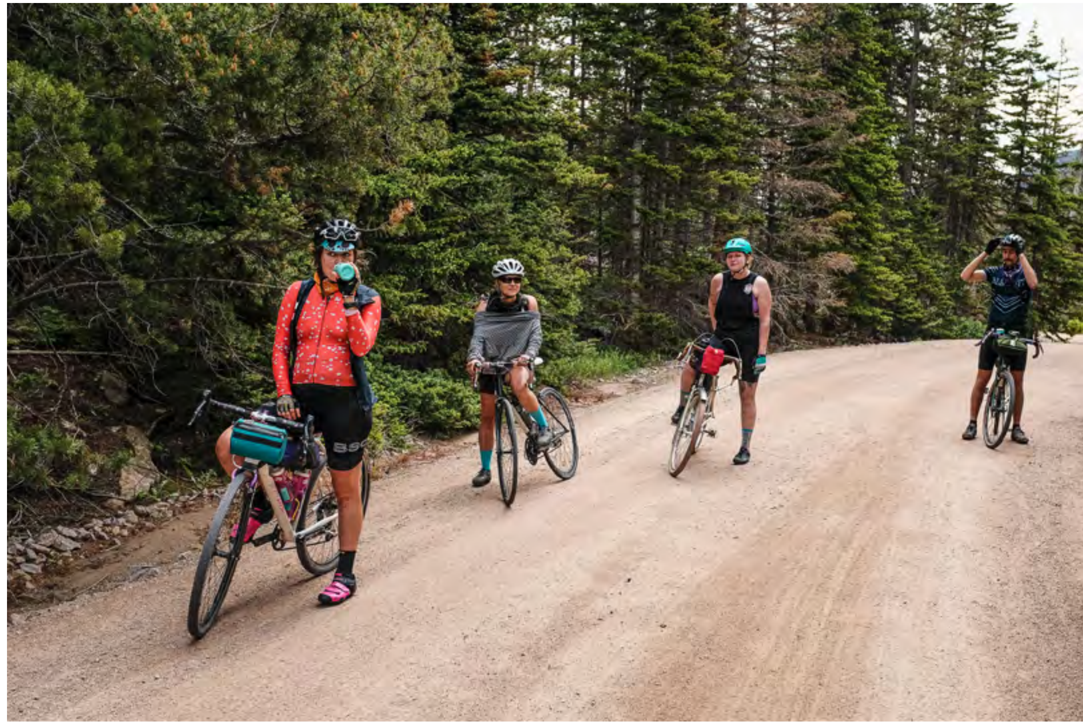
old fall river road